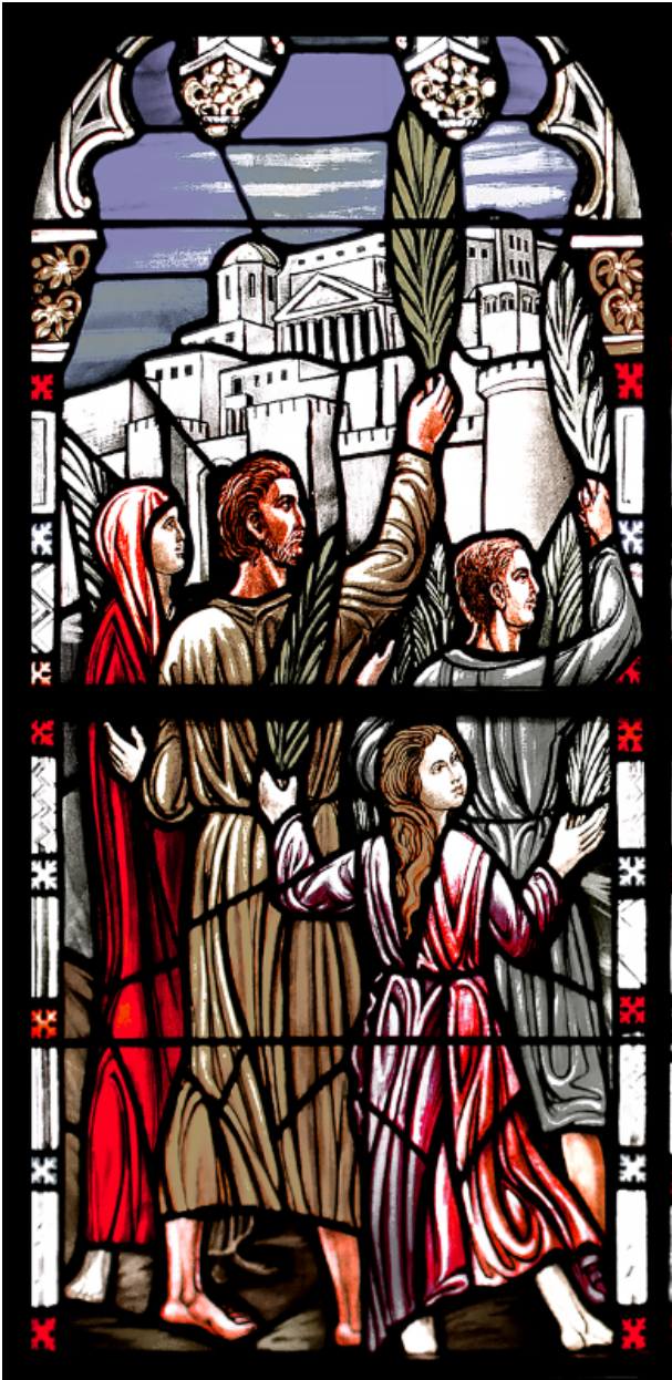
St. Luke’s window “Entry into Jerusalem”